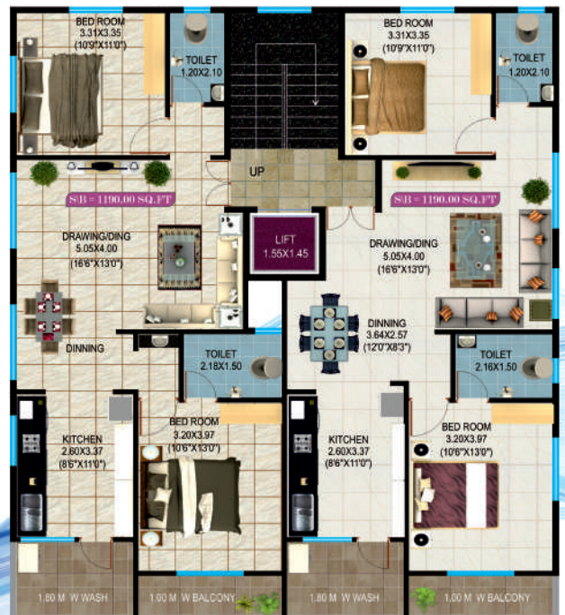
TYPICAL FLOOR PLAN [1st, 2nd, 3rd, 4th & 5th Floor]